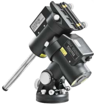
GM 1000 HPS 25kg (55 lbs) load capacity