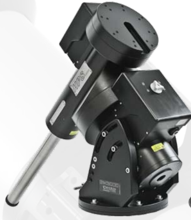
GM 3000 HPS 100kg (220 lbs) load capacity