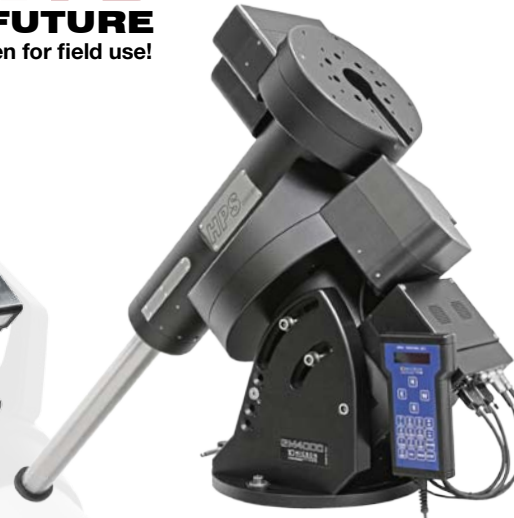
GM 4000 HPS 150kg (330 lbs) load capacity