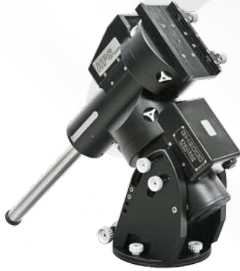
GM 2000 HPS 50kg (110 lbs) load capacity